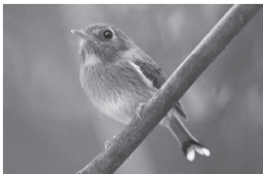
Fork-tailed Tody-Tyrant Hemitriccus furcatus (Vulnerable); frequently associated with bamboo and vine tangles

Look for Plain-tailed Nighthawks overflying the river just before sunset (13°15'42.70"S 43°25'41.47"W). Another site to try is the bridge over a tributary of the São Francisco (the rio Correntes) (13°08'56.64"S 43°32'24.55"W). Refer to Google Earth images to check exactly how to find both spots. In November 2009 the road to the second spot was in bad shape and hard to drive. Be sure to check the field marks of the bird carefully as Lesser Nighthawk Chordeiles acutipennis can occur in the same spot.