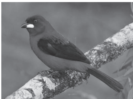
Brazilian Tanager Ramphocelus bresilius , Reserva Serra Bonita, October 2009, is fairly common in eastern Atlantic Forest.

rare Atlantic Forest population of White-winged Potoo Nyctibius leucopterus was recorded here.