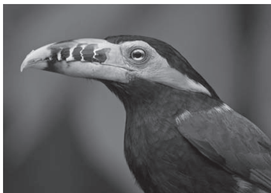
Male Spot-billed Toucanet Selenidera maculirostris , Reserva Serra Bonita, October 2009