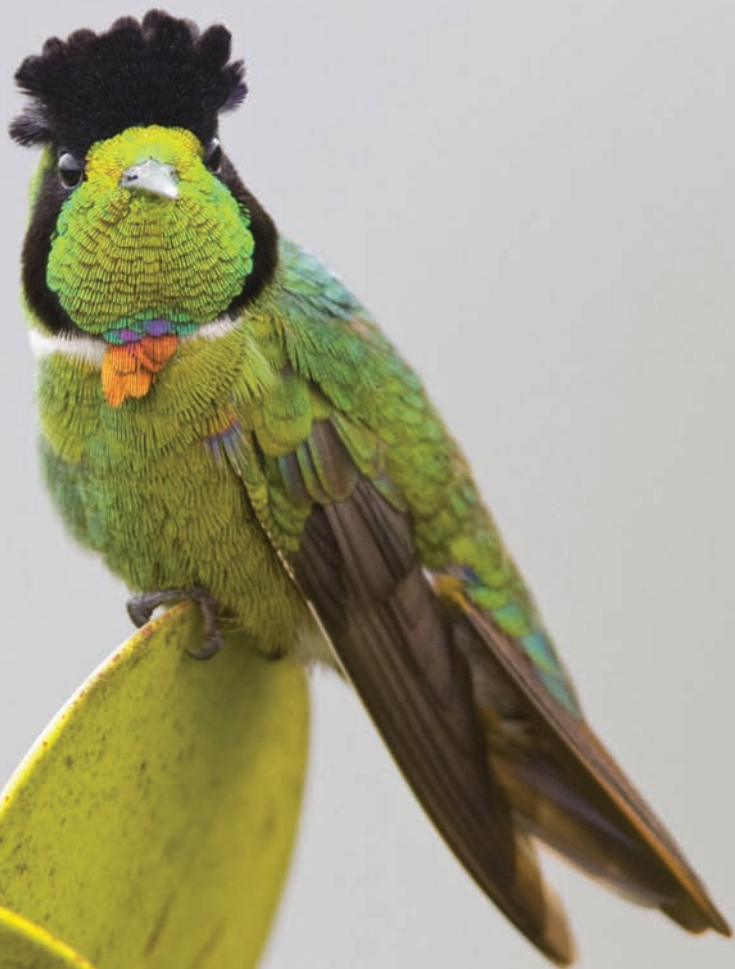
Male Hooded Visorbearer Augastes lumachella (Near Threatened), Morro do Pai Inácio, February 2010. Endemic to the state of Bahia and found on mountain-tops of the Chapada Diamantina

No birder can feel satisfied without ever visiting the country of Brazil, home to over half of the Neotropical avifauna. In this second and final part on top birding places in north-east Brazil, the author makes this point abundantly clear... What are you waiting for?