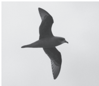
Figure 2. Murphy's Petrel Pterodroma ultima , c.30.5 km south-west of Alexander Selkirk Island, 9 November 2014 (Mike Danzenbaker)