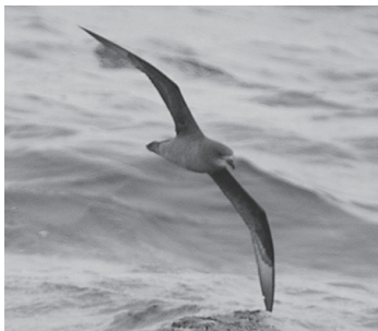
Figure 1. Murphy's Petrel Pterodroma ultima , c.22.5 km east of Robinson Crusoe Island, 7 November 2014 (Angus C. Wilson)

In November 2014, we undertook a three-week yacht-based expedition from central Chile to waters