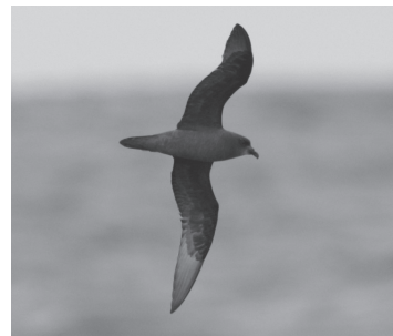
Figure 3. Murphy's Petrel Pterodroma ultima , c.22.1 km south-west of Alexander Selkirk Island, 9 November 2014 (Mike Danzenbaker)