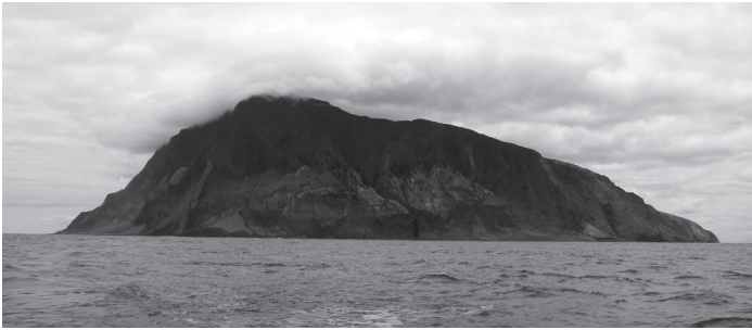
Figure 5. Alexander Selkirk Island, 10 November 2014; remote, rugged and inaccessible, Alexander Selkirk could easily hold hidden seabird secrets such as breeding Murphy's Petrels Pterodroma ultima