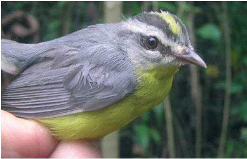
Figure 3. B. c. indignus , Perijá, Zulia, Venezuela, April 2004 (Miguel Lentino)