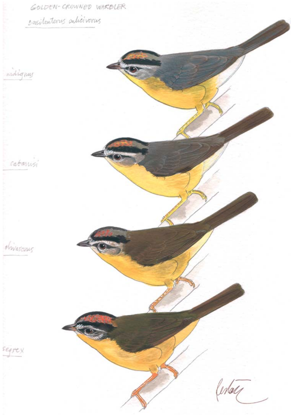
Figure 1. Four races of Golden-crowned Warbler Basileuterus culicivorus . Top, B. c. indignus ; second, B. c. cabanisi ; third, B. c. olivascens ; bottom, B. c. segrex . (Robin Restall)