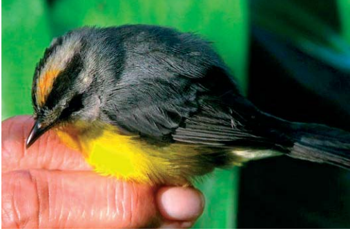
Figure 2. B. c. cabanisi , Rancho Grande, Henri Pittier National Park, Venezuela, October 2003 (Lorenzo Calcaño)