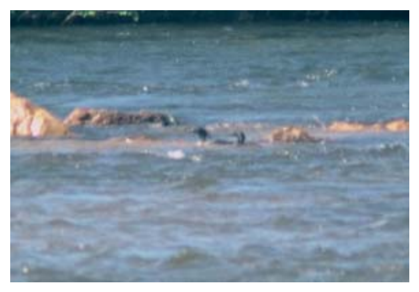
Figure 2. Pair of Brazilian Merganser Mergus octosetaceus on the rio Novo (Vívian S. Braz)

In the study area five other globally threatened species were recorded (species tape-recorded are marked, T, and those photographed, P): Dwarf Tinamou Taoniscus nanus (T), Crowned Eagle