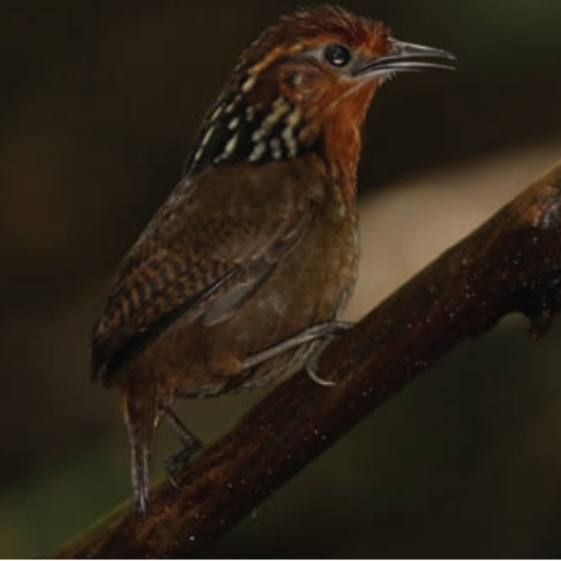
Above left: Musician Wren Cyphorhinus arada is an exceptional singer that every birder should have the pleasure of hearing at least once in his or her lifetime