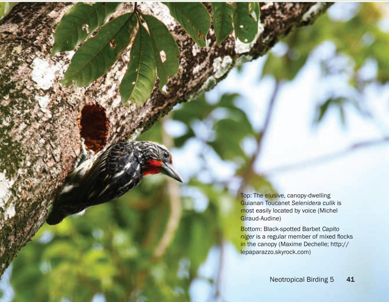
Top: The elusive, canopy-dwelling Guianan Toucanet Selenidera culik is most easily located by voice (Michel Giraud-Audine)