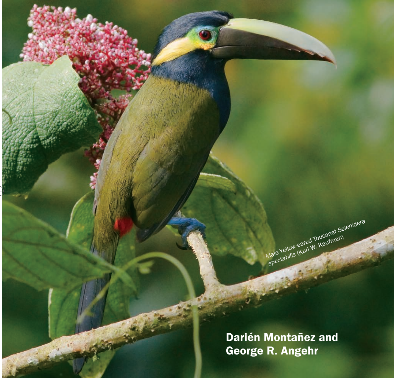
Male Yellow-eared Toucanet Selenidera spectabilis (Karl W. Kaufman)