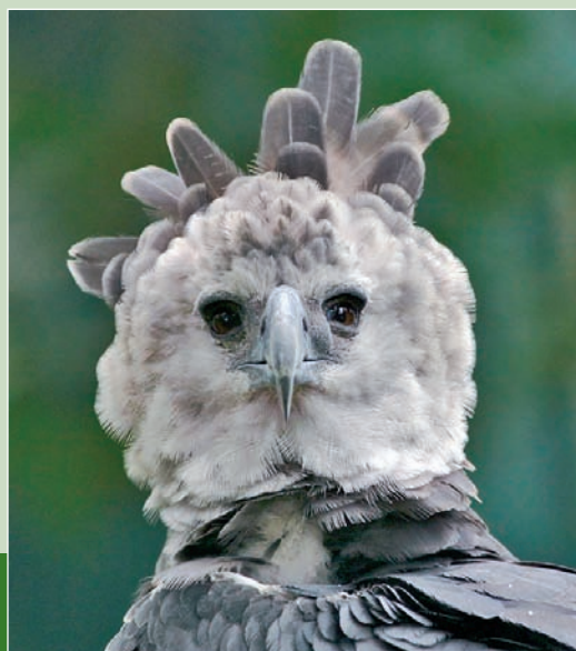
Harpy Eagle Harpia harpyja ; the most powerful bird of prey in the world is also the national bird of the Republic of Panama

The foothills of Chagres National Park, one hour east of Panama City, are home to a number of Darién Highland EBA endemics