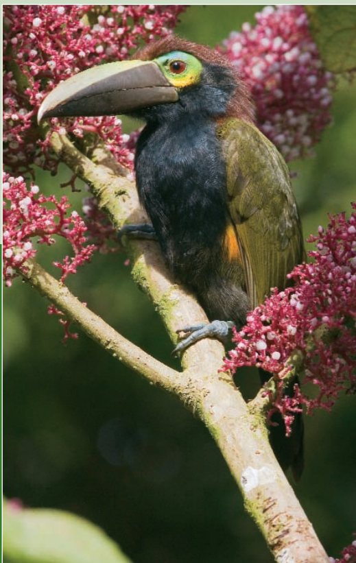
Female Yellow-eared Toucanet Selenidera spectabilis ; an uncommon bird found throughout the Caribbean Slope, but more common in the foothills of Chagres and Darién National Parks

The foothills of Chagres National Park, one hour east of Panama City, are home to a number of Darién Highland EBA endemics