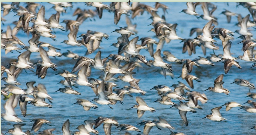
Western Sandpipers Calidris mauri with a few Semipalmated Sandpipers C. pusilla (Karl W. Kaufmann); Western is the most abundant species of the estimated 1.3 million small sandpipers that use the Upper Bay of Panama during migration