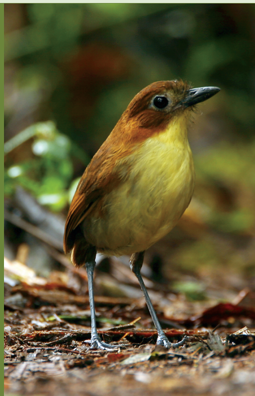
Figure 3 (below). Yellow-breasted Antpitta Grallaria flavotincta. This species is restricted to the west slope of the Andes and occurs mainly in Colombia. The southern end of its range just extends into north-west Ecuador where it is much sought-after. It is obviously closely related to White-bellied Antpitta G. hypoleuca but the latter is restricted to the east slope of the Andes and their ranges do not overlap.