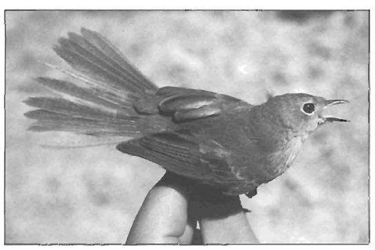
Figure 3. Slender-billed Finch Xenospingus concolor, second juvenile plumage, Tacna, Peru. (Tor Egil Høegsaas)