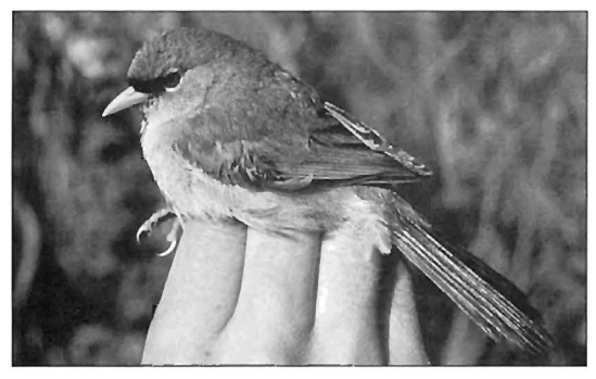
Figure 4. Adult Slender-billed Finch Xenospingus concolor, Tacna, Peru. (Tor Egil Høegsaas)

chin is almost grey. Wings have some grey and no wingbars are present. The bill is yellow, but on some individuals it has a dark tip; the legs are dark. The white orbital ring is normally less obvious than in younger birds with browner heads and brown irides.