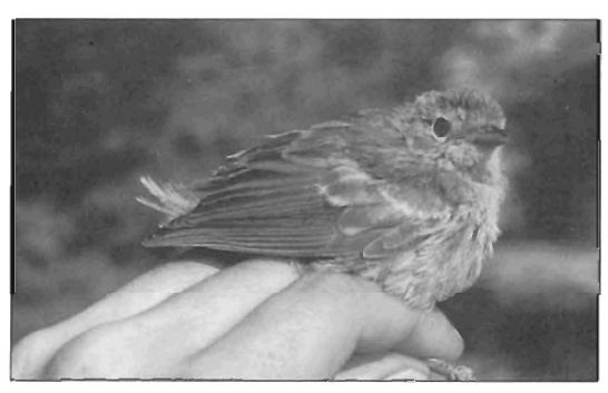
Figure 1. Fledgling Slender-billed Finch Xenospingus concolor, Ocucaje, Peru. (Oscar González)