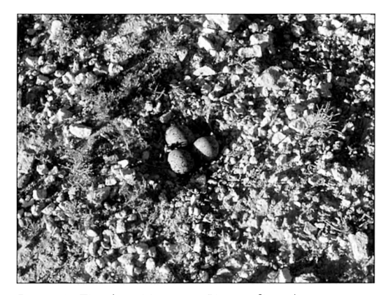
Figure 1. The first Mountain Plover Charadius montanus nest in Mexico, found in Coahuila, within a Mexican Prairie Dog Cynomys mexicanus colony (Martha J. Desmond)

Observations of C. montanus in north-east Mexico during the breeding season include individuals in breeding plumage exhibiting breeding behaviour. Knopf & Ruppert. report that seven (including three pairs), in breeding plumage, were observed in Mexican Prairie Dog Cynomys