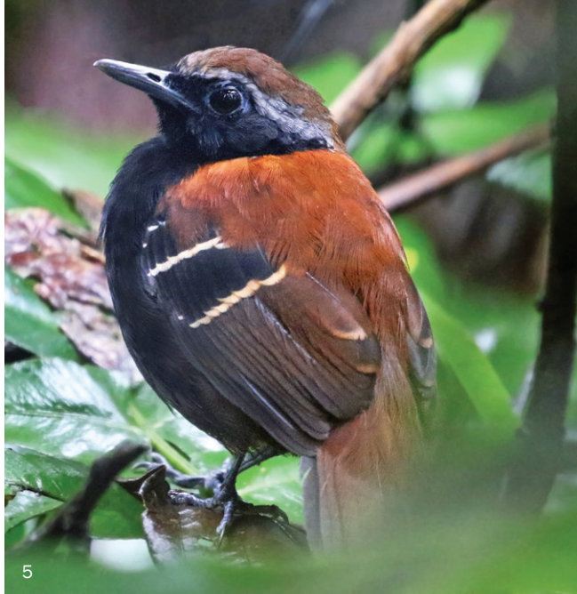
5 Cordillera Azul Antbird Myrmoderus eowilsoni, Flor de Café/Plataforma, San Martín, Peru, October 2016. A stunning, entirely new species that somehow eluded detection by even experienced visiting birders.