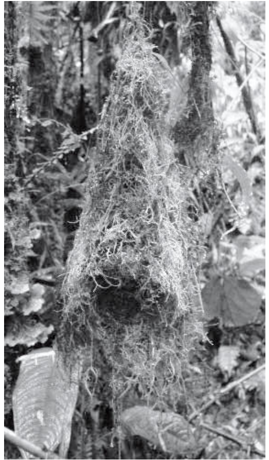
Figure 2 (left). Nest of Streak-necked Flycatcher Mionectes striaticollis at Yanayacu Biological Station, Napo province, Ecuador

All nests were located within 5 m of streams and five were suspended directly over water. Nests were found along small, 1–3 m-wide streams, as well as larger, 10–40 m-wide rivers. All but one were located inside relatively intact, moss- and epiphyte-laden forest with canopy height of 15–25 m and characterised by a relatively dense understorey of Cyathea spp. (Cyatheaceae) tree ferns, other fern genera, various Rubiaceae and Solanaceae saplings, and a variety of herbaceous Piperaceae, Gesneriaceae and Urticaceae. A single nest was found in highly disturbed forest, lacking canopy cover, but covered by a dense stand of bamboo ( Chusquea sp.) averaging 3 m in height. No