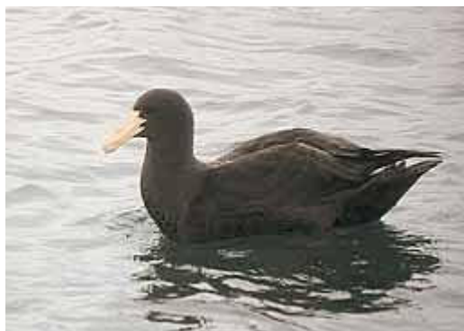
Figure 2. Southern Giant Petrel Macronectes giganteus in Baía Norte, Santa Catarina (L. L. Wedekin)