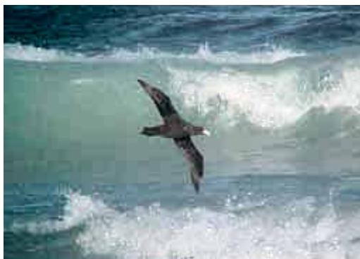
Figure 3. Southern Giant Petrel Macronectes giganteus at Moçambique beach, Santa Catarina Island