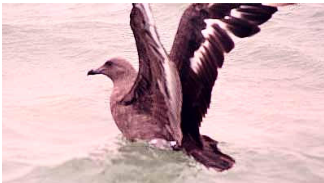
Figure 6. South Polar Skua Catharacta maccormicki in Baía Norte, Santa Catarina; note the slender bill, dark underwing-coverts and absence of a cap