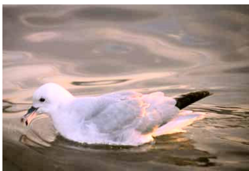
Figures 4–5. Southern Fulmar Fulmarus glacialis Saco Grande, Santa Catarina Island (L. L. Wedekin)