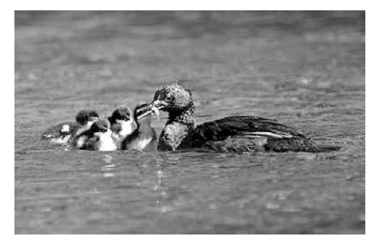
Figure 4. Adult Brazilian Merganser Mergus octosetaceus feeding a fish to the young (Sávio Bruno)

In all three broods, the ducklings, on reaching the ground, walked c.2 m towards the river until they reached the edge of the bank. On jumping into the water, their fall was broken by the roots of the vegetation. The time between the first young leaving the nest and the entire family reaching the water was less than three minutes in 2005 and 2007, and c.7 minutes in 2006.