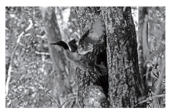
Figure I. Female Brazilian Merganser Mergus octosetaceus exiting the nest via the main opening (Sávio Bruno)