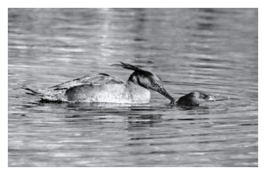
Figure 2. Pair of Brazilian Mergansers Mergus octosetaceus copulating (Sávio Bruno)

In 2006, at 09h42, the female left the nest after vocalising, landing on the water, where it continued to vocalise with the male. The first five young left, one by one, joining the adults in the water. After waiting for the three remaining young, which tried to reach the superior cavity in the nest, the female jumped onto a stone on the bank adjacent to the nest, being followed by two other ducklings vocalising next to her. The three remaining young jumped, grabbing the laterals of the nest with their feet, departing via the superior cavity. While the pair vocalised, the young chirped intensely. In 2007, the female initiated the vocalisation earlier than other years, at 08h07, and left the nest with the ducklings at 08h10.