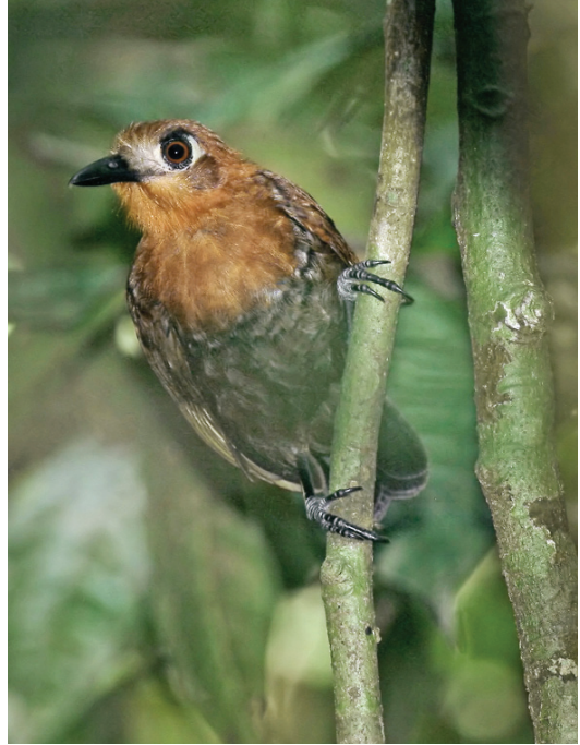
Figure 3. Pale-faced Antbird Skutchia borbae (Edson Endrigo)