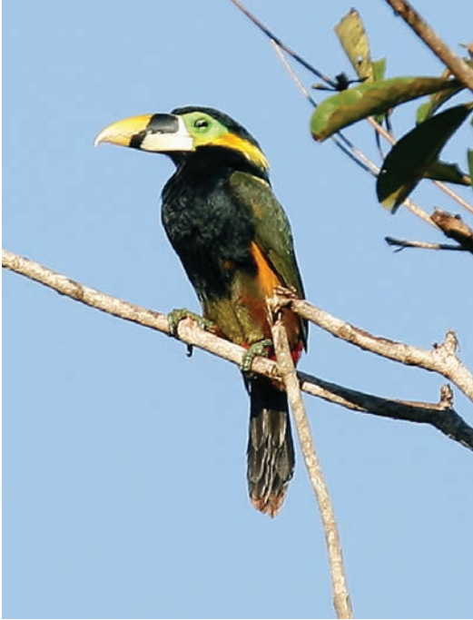
Figure 2. Gould's Toucanet Selenidera gouldii (Edson Endrigo)