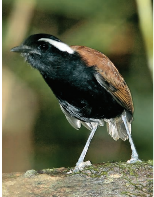
Figure 5. Black-bellied Gnateater Conopophaga melanogaster (Edson Endrigo)