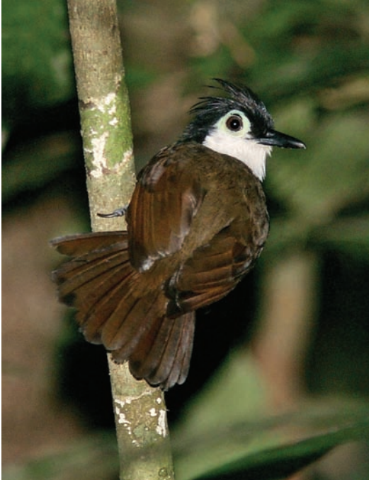
Figure 4. White-breasted Antbird Rhegmatorhina hoffmannsi (Edson Endrigo)