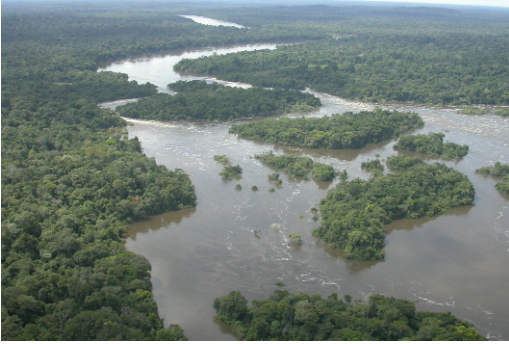
Aerial view of the rio Roosevelt and terra firme forest at Pousada Rio Roosevelt, Amazonas, Brazil (Andrew Whittaker)

some white water enters seasonally, especially into the rio Maderinha). Microhabitats sampled included: dense vine tangles, which are common due to the distinct dry season (especially along forested igarapés [streams]); second growth (by the airstrip); areas of boulders with deciduous forest; sandy-belt campina forest; a seasonally flooded black-water lake; and, on the right bank, small areas of bamboo