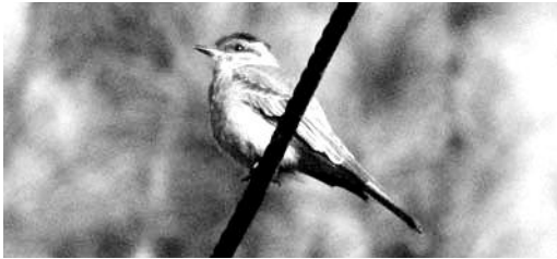
Figure 1. Crowned Slaty Flycatcher Griseotyrannus aurantioatrocristatus , Cerro Azul, Panama, 1 December 2007

rather stocky. It had a black cap with a narrow yellow central coronal stripe, which was only evident when the wind ruffled the feathers. The nape appeared slightly crested and there was a pale supercilium, with a dark eyestripe, black lores and grey cheeks. The bird's upperparts were grey, including the tail, which had a rufous tint at the base of the outer rectrices. The underparts were paler grey, grading to faint cream on the undertail-coverts. The secondaries had whitish fringes as did some tertials. The legs and feet were black. Viewed from below the bill was broad-based, mostly black, and pale only at the base of the mandible. Despite the good views, we were unable to identify the bird, which did not appear in Ridgely & Gwynne 12 .