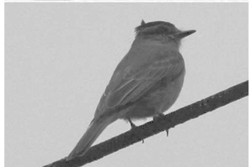
Figure 4. Crowned Slaty Flycatcher Griseotyrannus aurantioatrocristatus , Cerro Azul, Panama, 4 December 2007 (Kit Larsen)