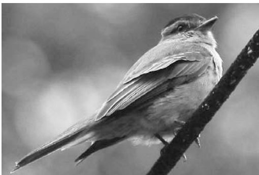
Figure 2. Crowned Slaty Flycatcher Griseotyrannus aurantioatrocristatus , Cerro Azul, Panama, 4 December 2007