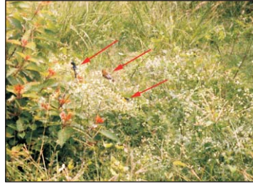
Figure 3. Lesser Goldfinches Carduelis psaltria , foraging near Trinidad village, Belize, December 2001

on the south bank of the Sibun River within Runaway Creek Nature Preserve, Belize District. The microhabitat was dominated by spiny bamboo Guadua longifolia and transitioned into a secondary broadleaf riverine forest. On 21 March 2000, two were captured in mist-nets and banded. One was a male and the other a female, with unflattened wing chords (uwc) of 61 mm and 58 mm, and weights of 12.9 g and 12.2 g. On 3 March 2001, an individual of unknown sex was banded; it had a uwc of 60 mm and weight of 12.8 g. On 4 March 2001, an adult male was trapped. This individual had a uwc of 63.5 mm and weight of 12.8 g. On 21 January 2002, a female with a uwc of 59 mm and weight of 12.4 g was trapped. All five individuals had completely ossified skulls and only a trace of subcutaneous fat.