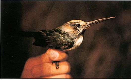
Figure 2. Three-toed Jacamar Jacamaralcyon tridactyla ; note the red spot on the upper iris and the broken mandible tip (HRN).