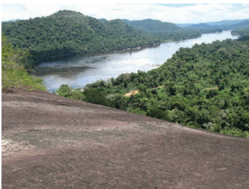
Figure 1. The lower Caura River as viewed from near Pará Falls; this point is generally considered the cut-off between the lower and middle Caura

Here we report 482 species detected along the lower and middle Caura and its tributaries (Fig. 2) and at sites near the town of Maripa and near the confluence with the Orinoco (Si'pao River lagoon; site 1), although comparatively less time was spent in llanos habitats. Highland sites in the upper Caura were not visited, but a montane element was detected in the cooler foothills of the Tabaro watershed; our study area ranged from c.30 m to 300 m. Our primary purpose was to assist members of two indigenous groups, the Ye'kwana and Sanema, to develop a database of indigenous bird names throughout the Caura basin. Several individuals from both groups were trained to use binoculars, a field guide 4 and to record bird vocalisations using Sony MZ-RH1 minidisc recorders and Audio Technica AT 835b shotgun microphones. Recordings were sent to the USA where identification was verified by IS & BO. Most of the species listed here were detected by us during six visits to the region in 2006–09: 2–11 March 2006 (JC, TM, IS); 19 May–3 June 2007 (PB, JC, TM, IS); 23 January–4 February 2008 (JC, TM, IS); 15–29 April 2008 (PB, TM, IS); 2–26 April