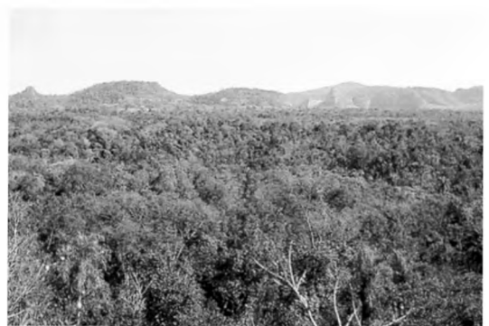
Campos cerrados forest, typical of Parque Nacional Cerro Corá, Paraguay. (Floyd E. Hayes)

Although the park can be reached by car or bus from Asunción, getting there requires driving most of the day through rural communities where the original forest habitat has long been cleared. Bus tickets can be booked at the main terminal in Asunción. Daily flights between Asunción and Pedro Juan Caballero facilitate access to the park, although transportation must then be arranged from Pedro Juan Caballero to the main (eastern) entrance of the park on the north side of the highway (Ruta 5) about 35 km to the south-west. Camping is available within the park; the nearest hotels are in Pedro Juan Caballero.