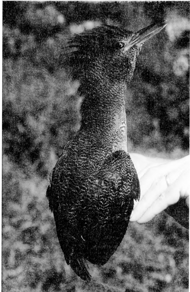
Zigzag Heron Zebrius undulatus

Apartado 16324, Candelaria, Caracas 1011-A, Venezuela.