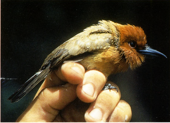
Chestnut-headed Nunlet Nonnula amaurocephala , Jaú National Park, Amazonian Brazil, January 1994 (André Carvalhaes) (see p48)