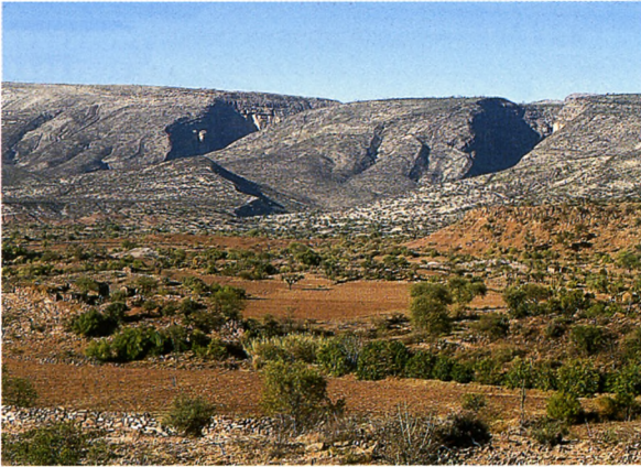
Tilled fields in the Río Caine valley, August 1993 (Robin Brace) (see p27)