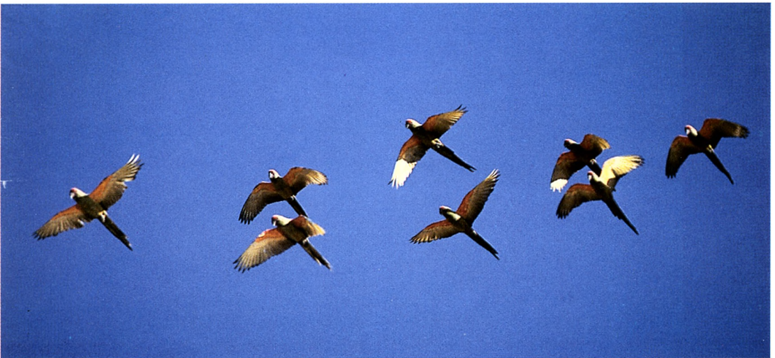
Red-fronted Macaw Ara rubrogenys , party in flight over the Río Caine valley, August 1993 (Robin Brace) (see p27)