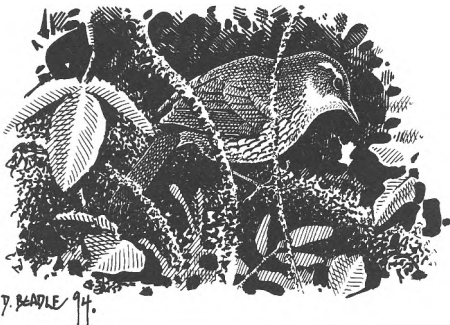
White-throated Barbtail Margarornis tatei

need to be taken to help develop a conservation strategy for this species.