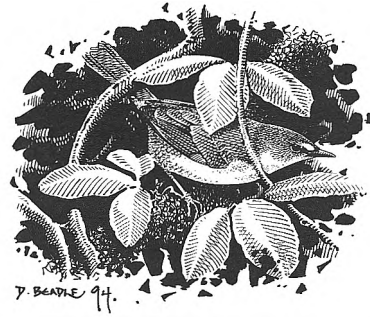
Grey-headed Warbler Basileuterus griseiceps (David D. Beadle)

These recent observations suggest that B. griseiceps (and probably also D. venezuelensis ) is more seriously threatened than was previously realised and could be in danger of extinction. In the surveyed patch on Cerro Negro we estimate the population to be c.2-5 pairs (the cluster of observations in Fig. 1 might suggest there is only one pair involved). Around Caripe no more than 10 similar patches remain. Some of these patches, including those on Cerro Negro, are within El Guácharo National Park and should therefore be protected although the reality is that habitat destruction continues and current levels of interventions are insufficient to stop it com-