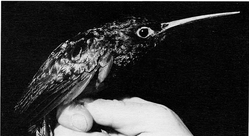
Coppery-chested Jacamar Galbula pastazae , Podocarpus National Park, Ecuador, Nov/Dec 1991

The lower slopes of the eastern Andes, from about 1,000 to 2,000 m, are seriously affected by rapid clearance for agricultural purposes (subsistence settlement, cattle graz-