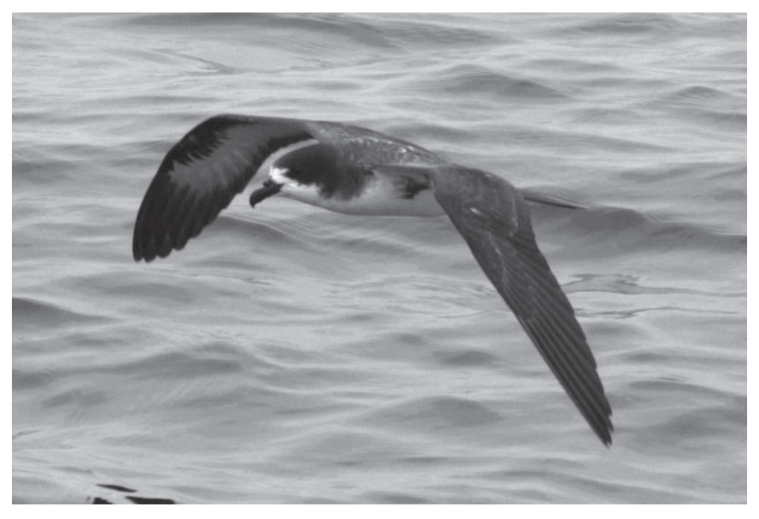
Threatened by introduced pests and tramplers, the Galapagos Petrel Pterodroma phaeopygia wanders to continental Ecuadorian waters during the non-breeding season