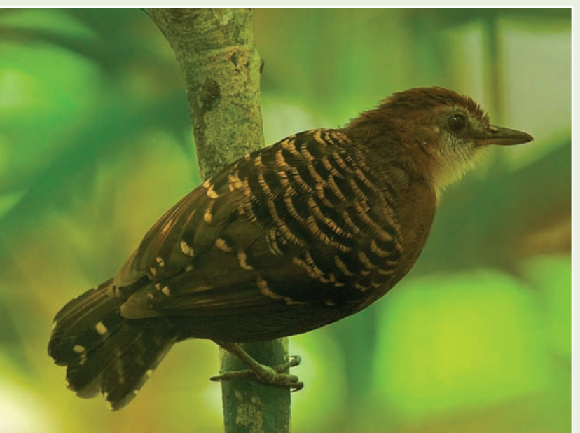
Top to bottom:

Toucan Barbet Semnornis ramphastinus (Murray Cooper); one of the most characteristic endemics of the Chocó cloud forests