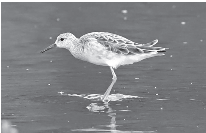
Figure 1. Non-breeding adult Ruff Calidris pugnax , Cayo Coco, Sabana-Camagüey archipelago, Cuba, April 2017 (A. Kirkconnell Jr.)

Received 23 April 2017; final revision accepted 8 June 2017