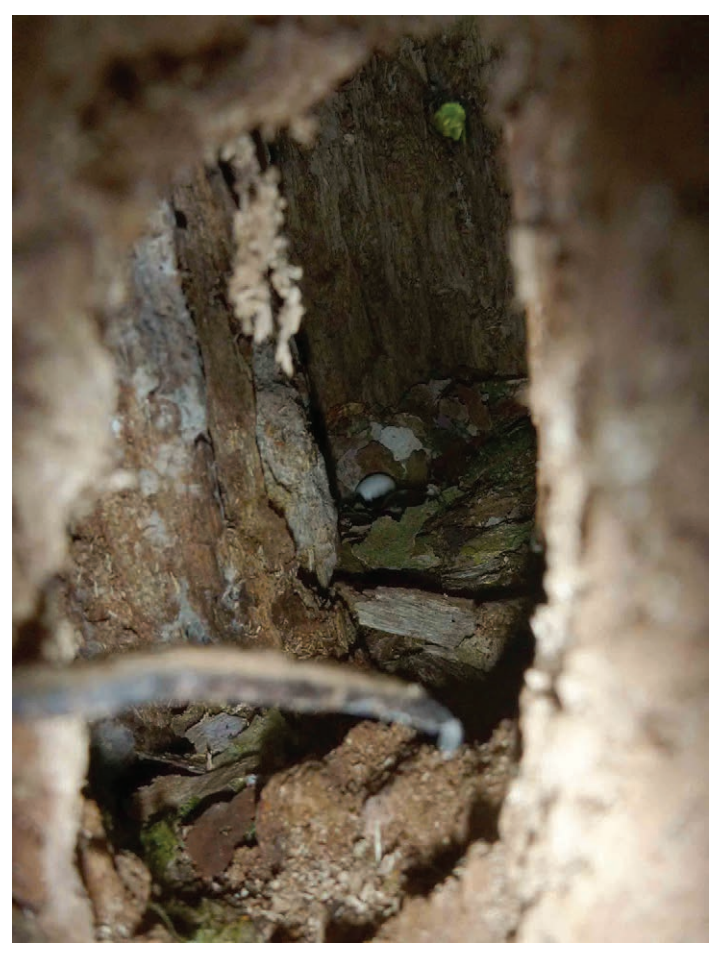
Figure 3. Interior of Long-tailed Woodcreeper Deconychura longicauda nest, with one white egg clearly visible, and a second one just below it to the right; small hole, probably natural in origin, visible in rear wall of cavity, El Chorogo, Chiriquí prov., Panama, 3 March 2014

This is only the second nest of Long-tailed Woodcreeper to be described and the first in >100 years (as well as the first in Panama). The first nest was also in a natural cavity in a dead trunk, but was sited much higher