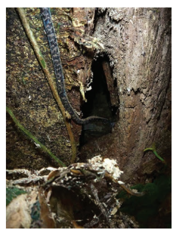
Figure 2. Entrance to Long-tailed Woodcreeper Deconychura longicauda nest: note fresh wood flakes scattered below indicating the birds had enlarged the interior of the nest, El Chorogo, Chiriquí prov., Panama, 3 March 2014 (W. J. Adsett)

The nest (Figs. 1–3) was in primary forest at 08°17.172'N 82°59.966'W (618 m), just within Panama. The well-decayed stump was 150 cm high with a diameter of 27 cm. The entrance (which faced south-east) and at least part of the nest chamber were clearly natural in origin, while the presence of some small soft wood chips below the nest indicated that the chamber had been enlarged. The entrance hole was 55 cm above the base of the stump, with a height of 13 cm and width of 3.8 cm. It, like the nest cavity behind