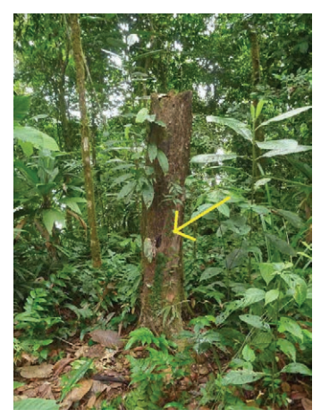
Figure 1. Decaying stump with arrow showing location of Long-tailed Woodcreeper Deconychura longicauda nest entrance, El Chorogo, Chiriquí prov., Panama, 3 March 2014 (W. J. Adsett)

In March 2014, we made our annual dry-season visit to the Panama Audubon Society's reserve (183 ha) in El Chorogo, Chiriquí prov., in westernmost Panama on the border with Costa Rica. It is located in a somewhat remote and rugged area of the Burica Peninsula that divides the Golfo de Chiriquí, in Panama, from the Golfo Dulce in Costa Rica. El Chorogo comprises a remnant (c.1,000 ha) of lowland forest that once covered the entire Burica and much of the Pacific slope of western Panama. Several nationally endangered