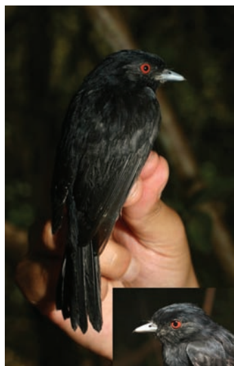
Figure 1. Male Blue-billed Black Tyrant Knipolegus cyanirostris mist-netted in the municipality of Catalão, south-east Goiás, Brazil, 10 August 2008 (Sandro Barata Berg)

Blue-billed Black Tyrant Knipolegus cyanirostris is usually found in humid and gallery forests, principally in southern and south-eastern Brazil, as well as the central west (Mato Grosso do Sul) and parts of Argentina, Paraguay and Uruguay 5-7 . In Brazil, it is considered migratory in the states