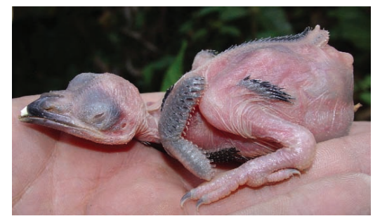
Figure 2. Nestling of Golden-headed Quetzal Pharomachrus auriceps, 22 days prior to fledging, Yanayacu Biological Station, prov. Napo, Ecuador (H. F. Greeney)