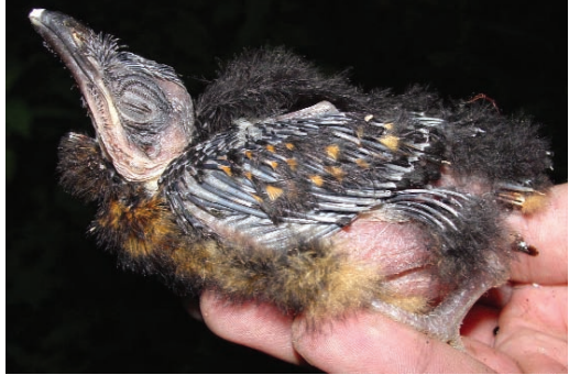
Figure 3. Nestling of Golden-headed Quetzal Pharomachrus auriceps , 15 days prior to fledging, Yanayacu Biological Station, prov. Napo, Ecuador