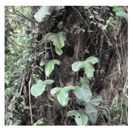
Figure 1. Nest cavity and environs of a nest of Goldenheaded Quetzal Pharomachrus auriceps , Yanayacu Biological Station, prov. Napo, Ecuador