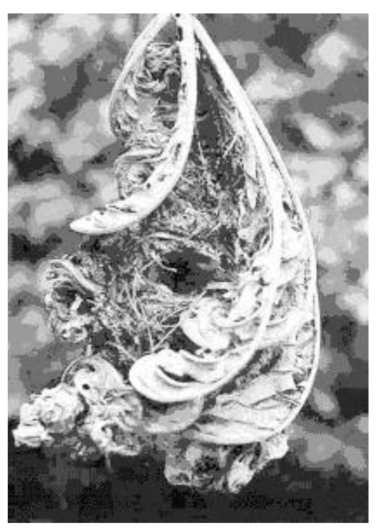
Figure 2. Nest of White-lored Tyrannulet Ornithion inerme (Gilmar Farias)

a breeding chamber 7.0 cm deep. The nest was entirely covered by small dry leaf petioles, leaves, moss, grass and flowers on the outside, forming a distinct layer from the plant fibre. The concentration of leaf petioles was greatest at the sides of the