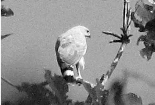
Figure 2. Juvenile Ornate Hawk-Eagle Spizaetus ornatus , Cerros de Amotape National Park buffer zone, Tumbes, Peru, May 2009