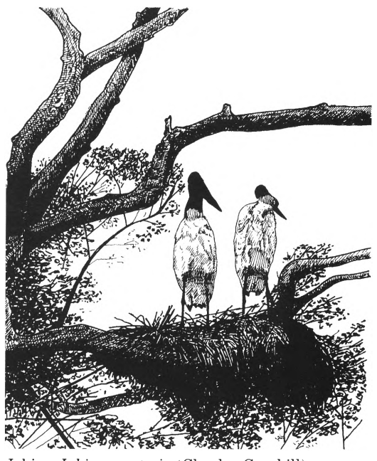
Jabiru Jabiru mycteria (Charles Gambill)

Critical nesting habitat for this species falls largely outside of the existing protected areas network and, as a result, this species is at risk from habitat disturbance <sup>14,15</sup>. Four nests of this species in Belize were reported by the Belize Audubon Society in 1996 (Belize Audubon Society in Curson & Lowen³) all in the vicinity of Crooked Tree. Two active nests along the west side of the New River Lagoon (one active for three, and the other active for four years: C. Godoy pers. comm.) in 1998–1999 may be