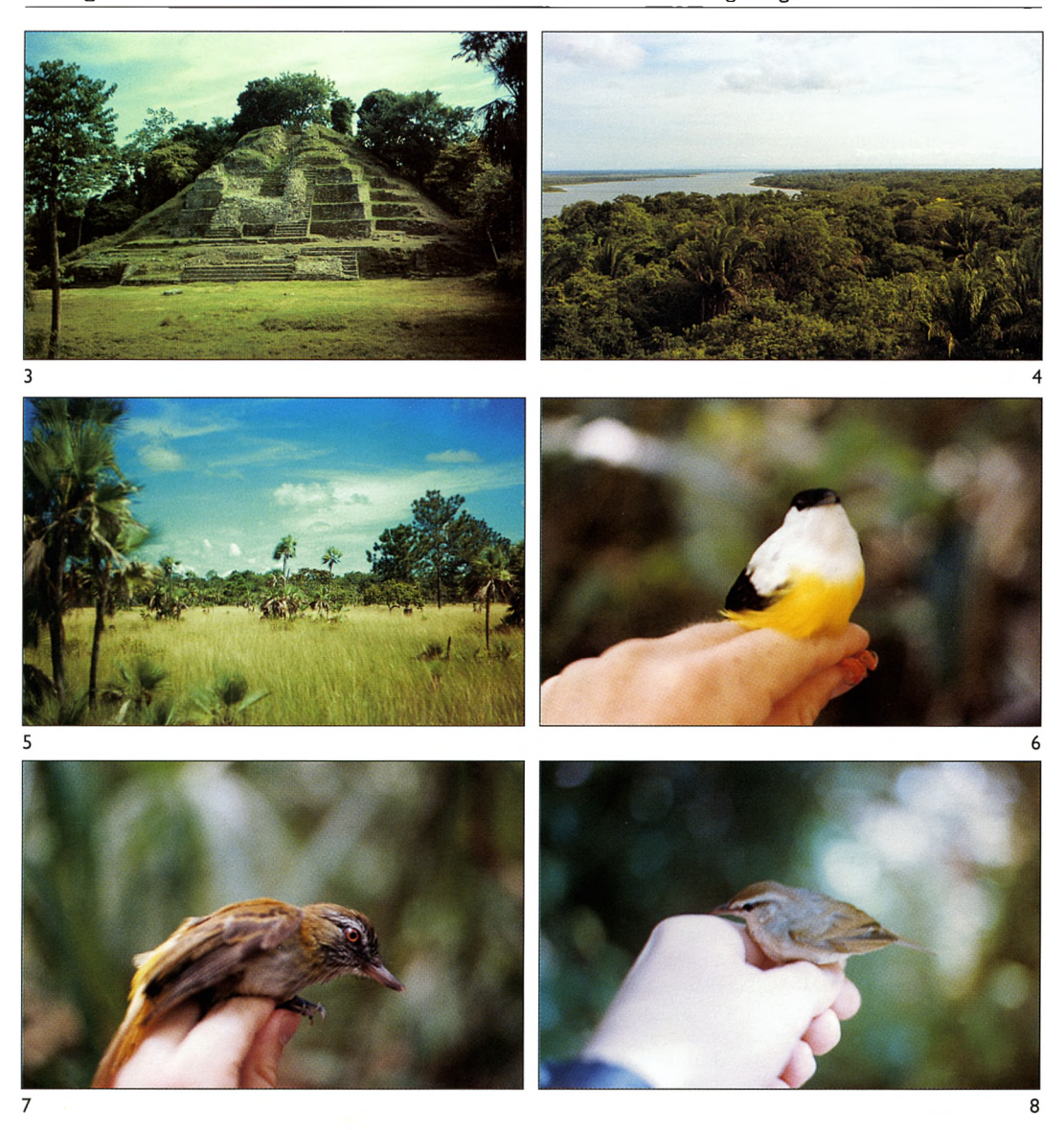
Figure 3. The Jaguar Temple (Structure N10-9), Lamanai Archaeological Reserve, Belize. As many as 1,000 major and minor structures lie within the reserve's boundaries (M. C. England)