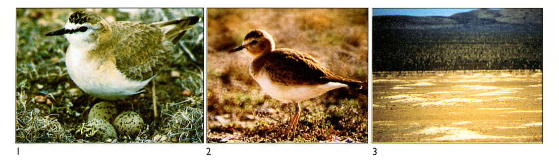
Figure I. Mountain Plover Charadrius montanus in breeding plumage at the nest in Colorado. All plovers seen in Nuevo León, 26–28 April were in this plumage.

Figure 2. Mountain Plover Charadrius montanus in wintering plumage on the Carbonera prairie dog town, January 1998