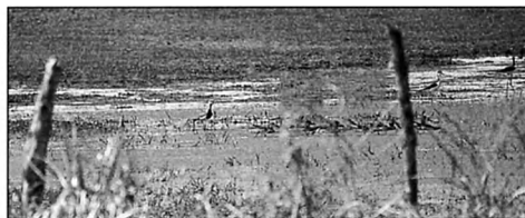
Above left and right: Southern Lapwing Vanellus chilensis (Roland van der Vliet)

beyond tail (SNGH); broad white leading edge to wings below carpal area; when preening and in flight (SNGH) showed black remiges and primary-coverts (possibly narrow pale fringes to outer primaries in flight), contrasting with white wedge broadest at carpal, and mostly grey-brown coverts (see sketch); wing pattern noticeably different from Chilean birds; tail, seen briefly in flight (SNGH), white with black subterminal band apparently extending to sides.