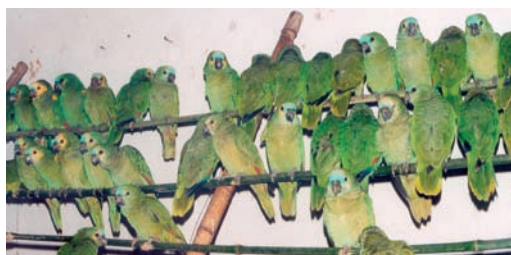
Figure 2. Individuals from the west side of the Sierra de Santa Bárbara showing green-shouldered, intermediate and xanthopteryx individuals, prov. Jujuy, north-west Argentina (Juan Ignacio Areta)

Examination of birds of comparable age (both fledglings and adults) throughout the SBC revealed that the variation described above is not age-related. All specimens that I examined (none from areas west of the SBC) displayed features of xanthopteryx and do not contribute to understand-