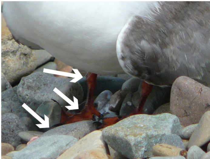
Figure 3. Close-up of the legs of the first-year Arctic Tern Sterna paradisaea (Marvin A. Tórréz). The elongated middle toe (lower white arrow) is proportionately longer than the tarsometatarsus (visible between upper and middle white arrows), a characteristic that separates this species from the similarly plumaged Common Tern S. hirundo .

although the wing-coverts were brown, whereas the flight feathers were grey, the brown carpal bar (Fig. 2) was not as strikingly contrasting as S. hirundo . In flight no black margins to the outer rectrices were visible, but the overcast conditions precluded good views of the tail.