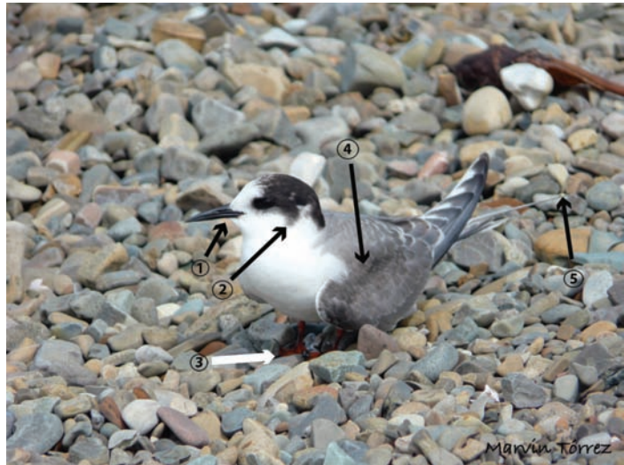
Figure 2. First-year Arctic Tern Sterna paradisaea , Ostional Bay, Nicaragua, 23 September 2008 (Marvin A. Tórrez)

Several morphological characters diagnostic in separating S. paradisaea from, e.g., Common S. hirundo , Roseate S. dougallii and Black Terns Chlidonias niger , are visible in Figs. 2–3. The bird's conspicuous cap, pale-banded mantle, rectrices, patterned (pale, rather than dark grey) primaries and tertials, suggest a juvenile in moult (D. Dittmann & L. Bevier in litt. 2009). Its very long wings and long outer rectrices, which