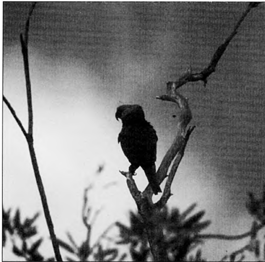
Spix's Macaw Cyanopsitta spixii, the rarest bird in the world

Penetrating the Thick-bills' habitat from below is the Military Macaw Ara militaris V , which