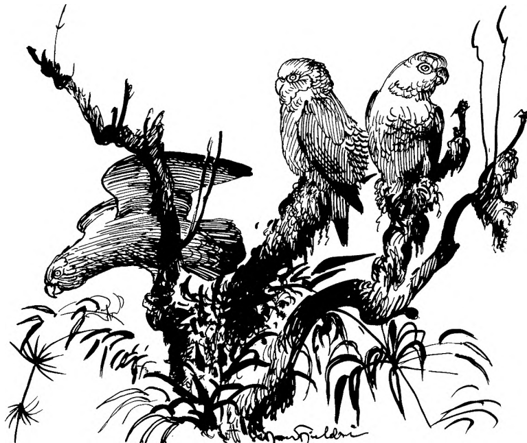
Rusty-faced Parrot Hapalopsittaca amazonina

Upland South America makes for the most heterogeneous grouping of threatened parrots, involving seven genera. Colombia is particularly important, with four species entirely within its