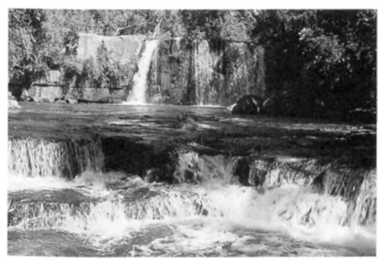
Arroyo Mina with Salto Cristal in the background at Parque Nacional Ybycuí, Paraguay. (Floyd E. Hayes)

The only previously published information on the birds of Ybycuí includes a brief list of birds along Arroyo Mina<sup>13</sup>, a few species mentioned in a brief review of the park<sup>2</sup>, and a few specimens and observations of migrants reported in two recent publications on bird migrants in Paraguay<sup>10, 11</sup> and in a review of the birds of Paraguay<sup>9</sup>. During the period of 1987-1994, we intermittently spent 28 days observing the birds of the park during each