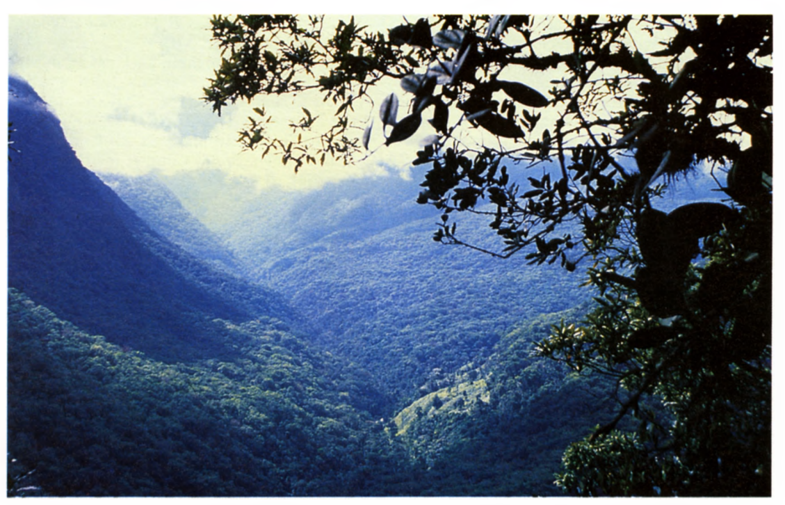
Sub-Andean and Andean oak forests of the interior valley of the Guanentá Sanctuary