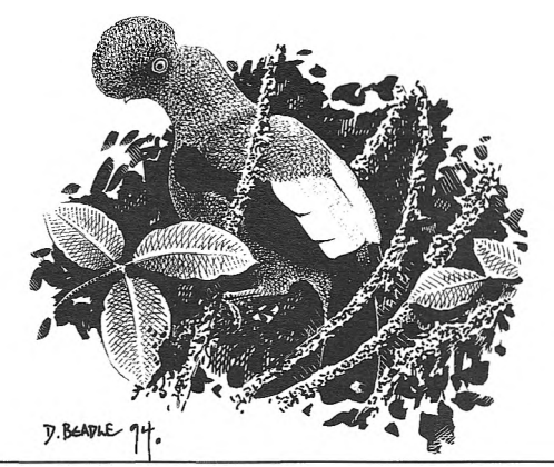
Andean Cock-of-the-rock Rupicola peruviana (David D. Beadle)

The Guanentá–Alto Río Fonce area stands out not only for its biological value, but for being the first conservation area in the country for which, according to the new constitution, protection is the result of community participation. To cope with new conservation challenges, the relevant institutions are seeking support from international agencies with the aim of making this conservation effort tangibly beneficial to the region and its inhabitants, both human and floral and faunal.