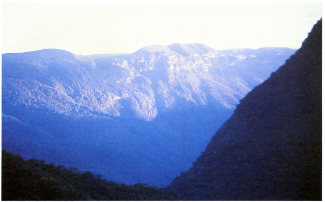
The Heart of Guanentá Sanctuary: slopes covered by tropical oak forest with high rocky paramo above the tree line (Augusto Repizzo)