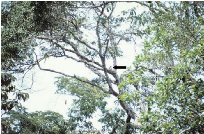
Figure 2. Telephoto view of female Banded Cotinga Cotinga maculata on nest, Porto Seguro Reserve, Bahia, Brazil, 11 October 1986

mid-afternoon, and although the female was initially off the nest she returned within a few minutes and was examined through a telescope, and a sketch was made (Fig. 3).