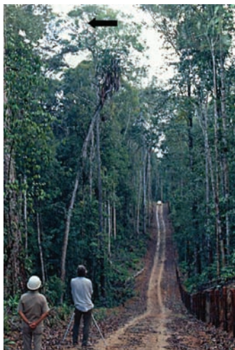
Figure 1. Track and trees in western Porto Seguro Reserve, Bahia, Brazil, 11 October 1986; sitting female Banded Cotinga Cotinga maculata indicated (L. P. Gonzaga)

We found a nest of Banded Cotinga Cotinga maculata on the western perimeter of Porto Seguro / Estação Veracel at c.07h30 on 11 October 1986. It was a flimsy structure of small twigs placed in the fork of an almost horizontal branch in the mid-canopy of a fairly tall tree in leaf (Fig.1). The female was first observed chasing away another female in some nearby trees; she moved to trees nearer the nest and fed rather hastily on a few berries, then flew directly to the nest and commenced incubating (Fig. 2). She was off the nest when we passed it at 11h30. Next day we visited the site in the