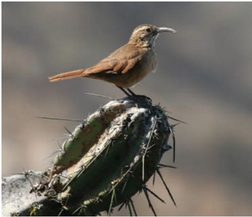
Figure 2. White-throated Earthcreeper Upucerthia albigula, Lurin Valley, Lima, Peru 1 February 2009