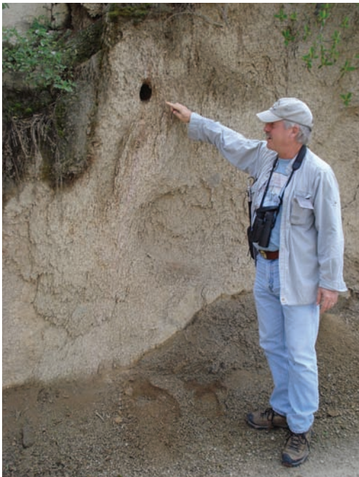
Figure 3. Nest burrow of White-throated Earthcreeper Upucerthia albigula , Lurin Valley, Lima, Peru (Richard E. Gibbons)

White-throated Earthcreeper Upucerthia albigula is a member of the Furnariidae that inhabits a narrow-elevation band on the Pacific slope of the Andes in Peru and Chile 5 . Its preferred habitat is described as arid shrubland with scattered columnar cacti 5,6 , arid-zone ravines with streams and bushes 2 , or arid montane scrub with sparsely