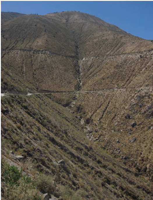
Figure 1. Habitat where White-throated Earthcreeper Upucerthia albigula was observed in Lima, Peru (Dan Lane)

Presentamos la evidencia de una extensión en el rango de distribución de Upucerthia albigula aproximadamente a 350 km al norte de la última información publicada. Se observó a U. albigula entre 2.300 y 2.600 m de altura en pendiente de la prolongación orientada hacia el sur de los Andes occidentales en el departamento de Lima, donde se encuentra el hábitat típico de esta especie, lo cual fue descrito por observadores anteriores. La evidencia se presenta con la observación de reproducción de la especie y de múltiples machos territoriales o de parejas.