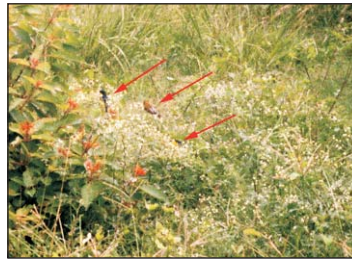
Figure 3. Lesser Goldfinches Carduelis psaltria , foraging near Trinidad village, Belize, December 2001 (Wilver Martinez)

on the south bank of the Sibun River within Runaway Creek Nature Preserve, Belize District. The microhabitat was dominated by spiny bamboo Guadua longifolia and transitioned into a secondary broadleaf riverine forest. On 21 March 2000, two were captured in mist-nets and banded. One was a male and the other a female, with unflattened wing chords (uwc) of 61 mm and 58 mm, and weights of 12.9 g and 12.2 g. On 3 March 2001, an individual of unknown sex was banded; it had a uwc of 60 mm and weight of 12.8 g. On 4 March 2001, an adult male was trapped. This individual had a uwc of 63.5 mm and weight of 12.8 g. On 21 January 2002, a female with a uwc of 59 mm and weight of 12.4 g was trapped. All five individuals had completely ossified skulls and only a trace of subcutaneous fat.