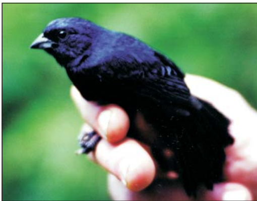
Figure 2. Blue Seed-eater Amaurospiza concolor , Runaway Creek Nature Preserve, Belize, March 2000 (Gene Albanese)

Howell et al. 7 and Valley & Aversa 18 provided records of A. concolor within Belize District. Jones & Valley 11 listed it as uncommon there and as being known from only 1–2 records in Orange Walk District. In 2000–2002, OAF and MT banded five individuals at a location (17°21'N 88°29'W, 38 m)