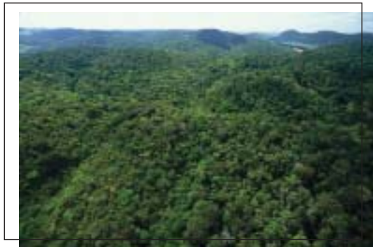
Figure 2. Usina Serra Grande contains one of the largest and best-preserved remnants of montane forest in Alagoas; it harbours a considerable number of endemic and globally threatened species