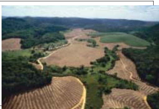
Figure 1. Extensive areas of forest have been destroyed to make way for sugarcane plantations, leaving the landscape heavily fragmented (Luiz Claudio Marigo)

The forested belt north of the rio São Francisco is one such area, generally referred to as the 'Pernambuco centre' 12,57 . It includes both the coastal forests and complex transitional area between them and drier habitats inland. The Pernambuco centre is considered an area of interchange between biota